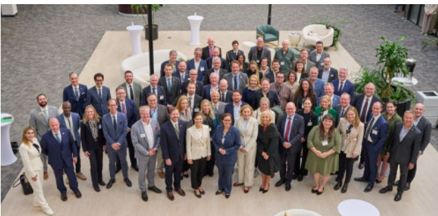
The members of the Swedish Delegation, BAHEP members, and BAHEP staff in the BAHEP Atrium enjoying a networking lunch after the roundtable discussions.