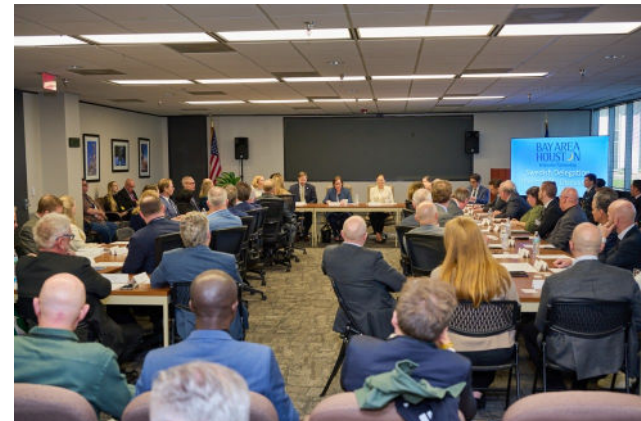
Almost 80 participants gathered in the BAHEP conference room to participate in the roundtable discussion centered on the future of space and international partnerships.

BUSINESS to BUSINESS is a monthly Bay Area Houston Economic Partnership publication in partnership with THE DAILY NEWS. BAHEP is a member-driven organization that provides the leadership to stimulate regional economic development and employment in southeastern Texas. Its members include more than 360 business partners encompassing 18 cities, Galveston and Harris counties, the Houston Airport System, and Port Houston.