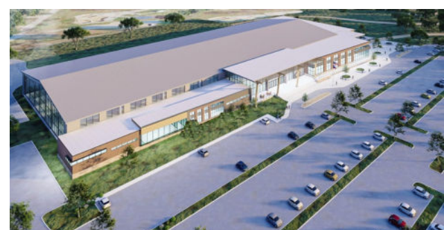
Rendering of the Event and Community Center.